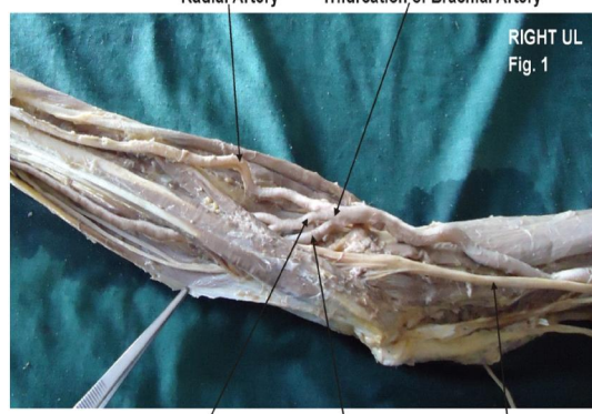
Common Interosseous Artery Ulnar Artery Median Nerve

Radial Artery Trifurcation of Brachial Artery